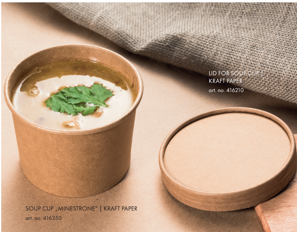
LID FOR SOUP CUP | KRAFT PAPER art. no. 416210