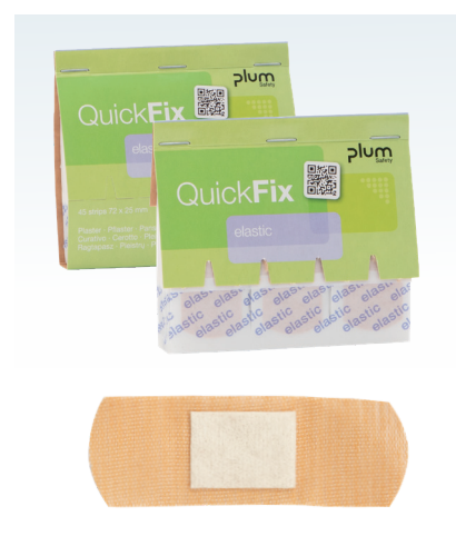
QUICKFIX ELASTIC REFILL 45 elastic and comfortable textile plasters that adjust to the movements of the skin. The plasters are skin-friendly and allow the skin to breathe.